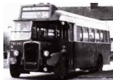
The Bristol LL6B bus No. 34 service in North Dean.