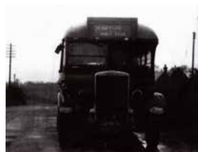
Leyland Tiger bus opposite the Old George with Turnip End in the background.

During the war the service was provided by a Leyland Tiger bus (Reg no. ABL 761) and then in the 1960s by a Bristol LL6B (Reg no. FMO 949). This bus spent its working life travelling up and down the valley averaging an annual mileage of around 55000 miles. It was withdrawn and replaced in about 1967 but continued in service elsewhere until 1977. During its working life its total mileage is estimated at some 800,000 miles. It has recently been recovered by Ward Jones and is apparently under cover somewhere in Maidenhead awaiting restoration.