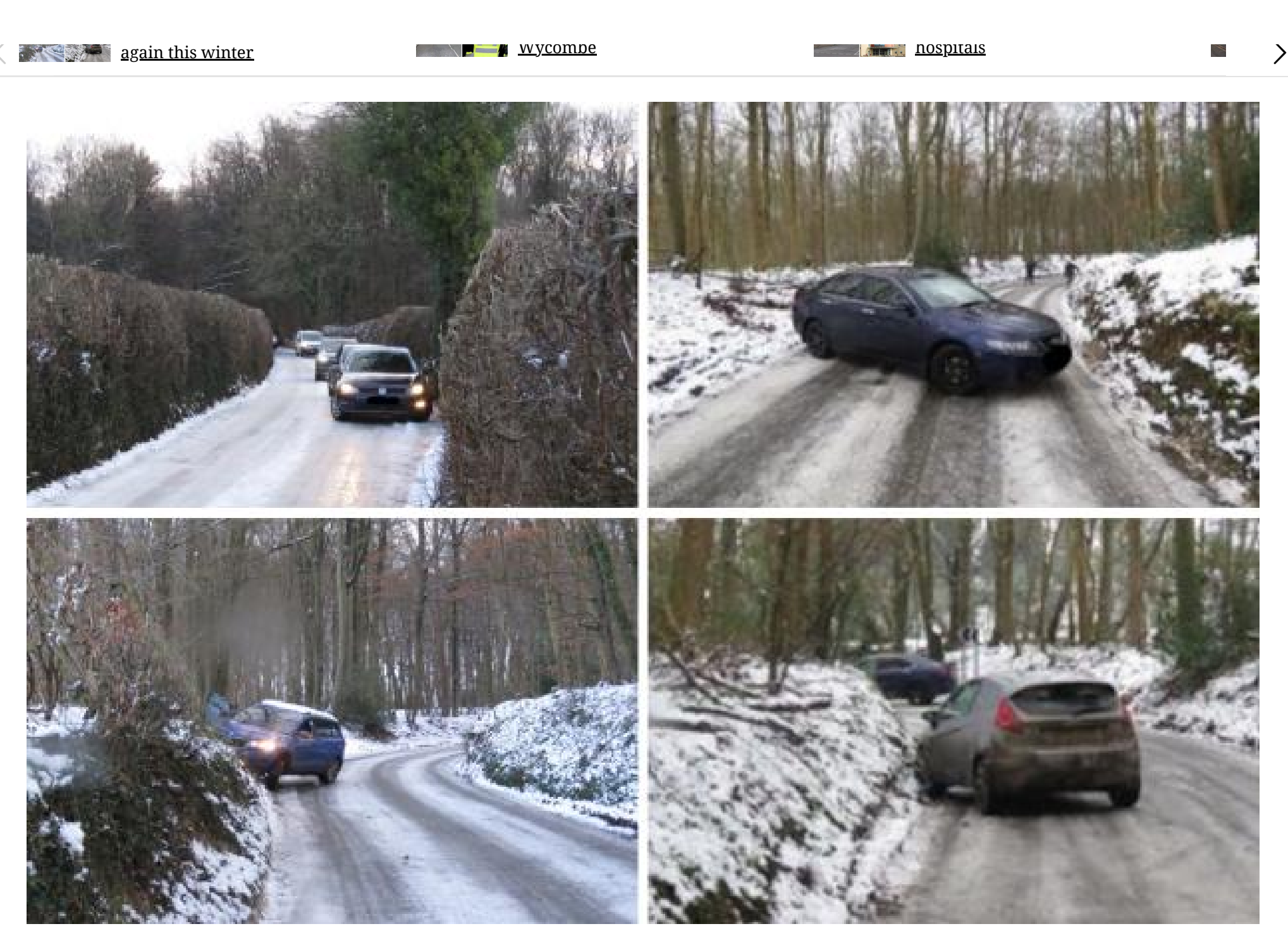
Fears icy lane that claimed 17 cars in three days will strike again this winter

A country lane that claimed 17 vehicles in just three days because it was 'not gritted' during snowy weather has prompted fresh concerns as