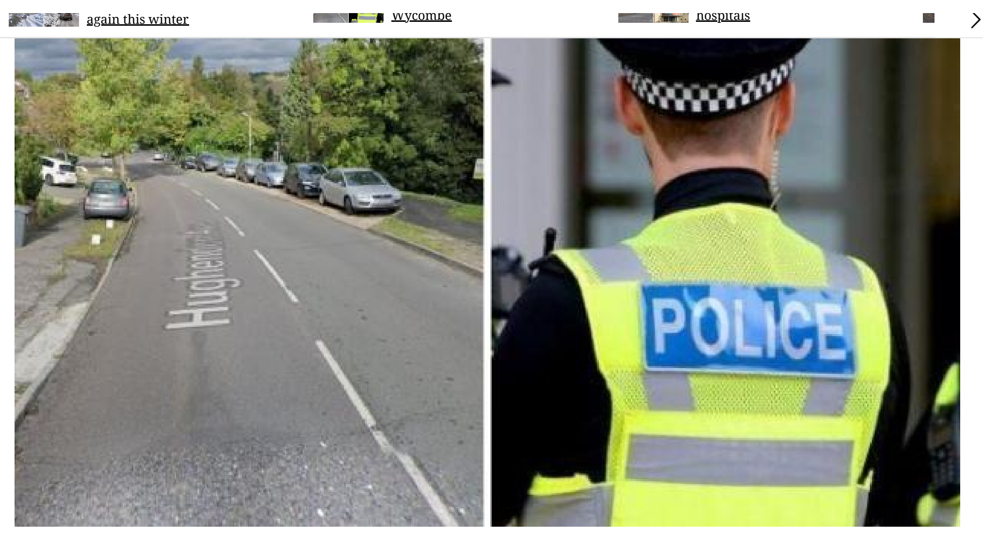
'Hit and run' investigation ongoing after man died in High Wycombe