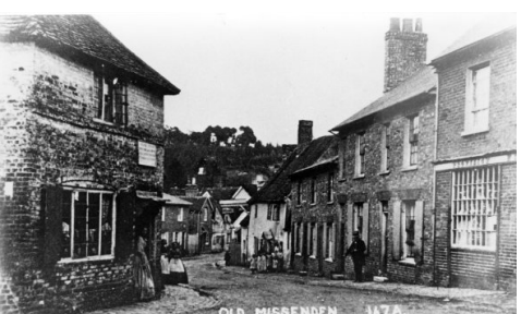
Earlier view of Church Street - High Street junction

The only history website that allows a search by house from census records is Find My Past. However, even this only gives Church Street (don't be deceived by